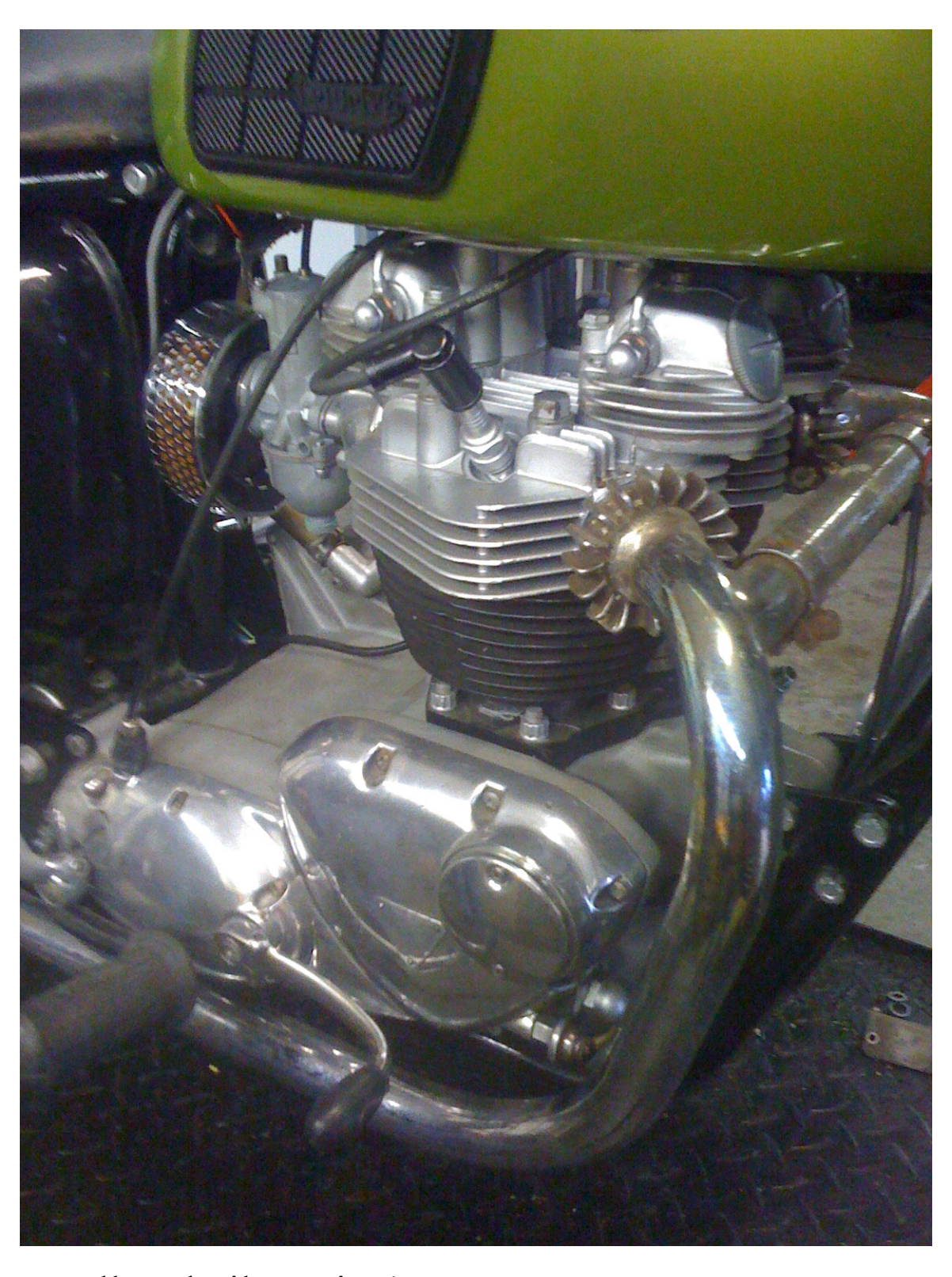
Totally rebuilt engine!